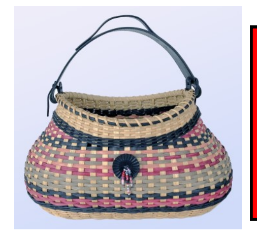
8 W 007 - 8 HOUR Ocean Breeze Piggyback Marilyn Parr

This is the 3rd in the series using the Piggy-back handle. It is woven on a wood base that is Amish made and will have spokes glued in and weaver ready for class. The challenge of this basket will be in the shaping. Colors used: denim, granny smith green, hyacinth and teal. New color: black and raspberry. Button embellishments included in kit price.