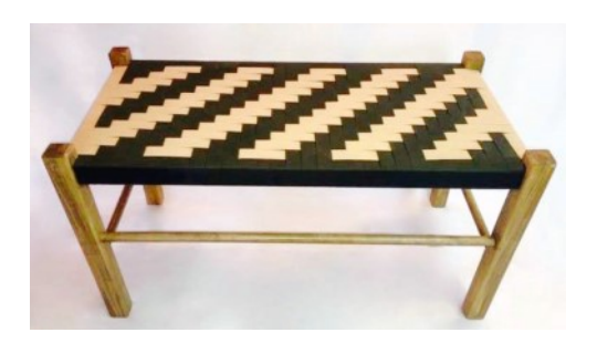
4 F PM 035 - 4 HOUR Home Room Bench Steve Atkinson

This bench is made to fit any room in your house. In class, students choose from a great color selection of Shaker tape and/or nylon webbing. Learn two weaves on the bench, one on top and one under the seat. Feature of the bench is center support, completely hidden in the weaving process. The pine bench comes stained/varnished and ready to weave. NOT TO BE USED AS A STEP STOOL.