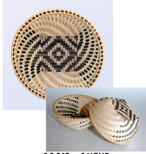
6 S 042 - 6 HOUR Diamond Bowl JoAnn Kelly Catsos

This charming low cathead bowl is woven out of natural and stained black ash splint over a wooden mold. It boasts a diamond design in the base, twilled sides and lashed hardwood rim. Pattern includes directions for Black Diamonds and Diamond Reflections . Student tool box provided.