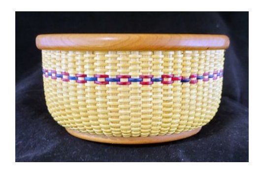
6 F 029 - 6 HOUR A Little Bit of Color Nantucket Candy Barnes

Dimensions: 9 1/2"L X 6"W X 5"H w/o hdl Teaching, Material and Prep Fee: $62