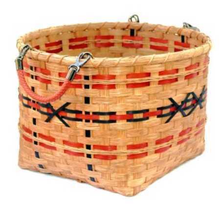
6 F 027 - 6 HOUR Cestino Grande Bonnie Rideout

Cestino Grande means, literally, Large Basket in Italian. And large it is! Roomy enough for multiple uses in any room of your home. The accent colors are black and rust. Techniques include weaving a filled base, twining, triple twining with an arrow weave and the use of overlays. Skids are woven on the bottom for extra strength. Pretty round leather braided handles really set this basket off!