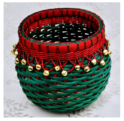
4 U 050 - 4 HOUR Jingle All The Way Anne Bowers

Welcome the holiday season with this cute little basket! Students begin by inserting spokes in a wood base and weave a twill pattern so that the basket sides round up. Pieces of round reed are inserted into the weaving at top to create a scallop effect with jingle bells attached. Rim is added with a dyed rim filler - rim is lashed with waxed linen. A keepsake for many years to come!