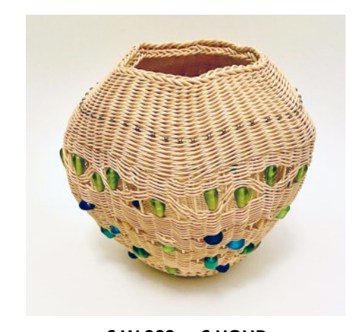
6 W 009 - 6 HOUR Tidal Wave Sheri L VanDuyn

Dimensions: 5 1/4"Circumference Teaching, Material and Prep Fee: $55 Weaving levels: Intermediate