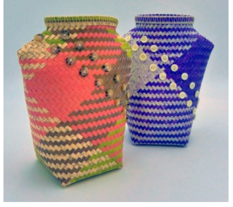
8 W 006 - 8 HOUR Plaid Button Up Annetta Kraayeveld

Weave a beautiful paper basket with a striking plaid pattern and offset shoulders using hand painted, hand cut paper and diagonal twill weave. Buttons 'dress' it up! Color choices will be available. Students <a href="mailto:must">must</a> have diagonal twill experience.