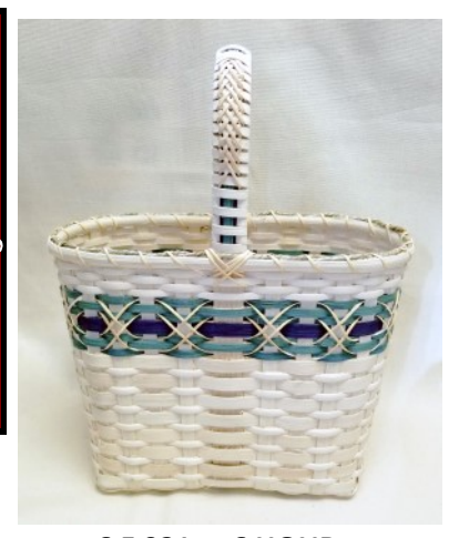
6 F 031 - 6 HOUR Infinity Wine Sharon Klusmann

This timeless Wine/2-liter pop carrier is accented with thin chair caning. The majority of the basket is S/S weaving with a woven divider down the center to keep the bottles from touching. Learn this Infinity cross over center design overlaying the purple and hunter reed, the caned cross over handle and caned rim with God's-eyes at each handle.