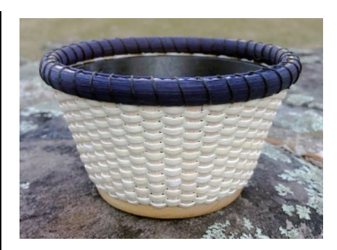
4 S AM 046 - 4 HOUR Japanese Pin Cup Kathleen Petronzio

A Japanese Pin Cup is iron and contains a flower frog used for flower arranging. This basket is woven around the Pin Cup using a round base, Hamburg cane as a weaver, a navy blue rim and lashed with waxed linen.