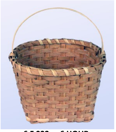
6 F 032 - 6 HOUR The Small Williamsburg Billy Owens

This basket is made from White Oak trees I select and prepare by hand using homemade tools my Dad made and used. It has a square woven Oak Herringbone bottom, a round top and a solid Oak handle. I will share the process of how I choose, harvest and turn a tree into pliable weaving material. It will be woven over a mold and everyone should leave with a beautiful, finished basket that will last a lifetime.