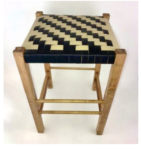
4 F AM 033 - 4 HOUR Kingston Bar Stool Steve Atkinson

Woven bar stool is perfect height for kitchen counter or high table. Woven with shaker and/or nylon webbing. Allows the student to have a large selection of color combinations. Seat includes foam padding for comfort. Students have choice of pattern- either 2x2 twill or checkerboard pattern.