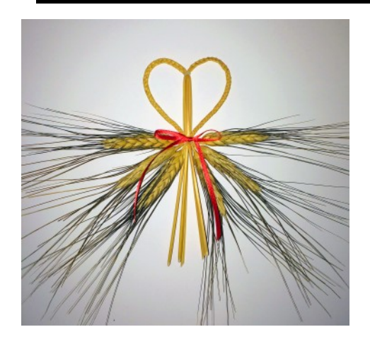
4 U 048 - 4 HOUR Wheat Weaving Ornaments JoAnn Kelly Catsos

Learn traditional wheat weaving techniques, such as the hair braid and compass plait, and how to make wheat straw roses. Then using your new skills, create at least 3 projects with this eye-catching black bearded wheat. These are perfect for holiday decorations or on a gift instead of a bow. A student tool box will be provided.