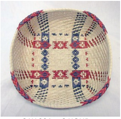
8 W 004 - 8 HOUR Diamond Jubilee Gina Kieft

This beautiful bowl is full of eye catching diamonds. Woven with natural, dark brown and your choice of a second color, follow a graph or written directions to complete the base. The side weaving is a continuous twill while you work on shaping and spoke placement. A three strand braid is added as a rim filler in the corners to highlight the base colors. Many color choices will be offered to weave with.