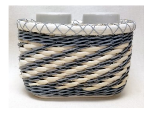
4 U 055 - 4 HOUR Swirls