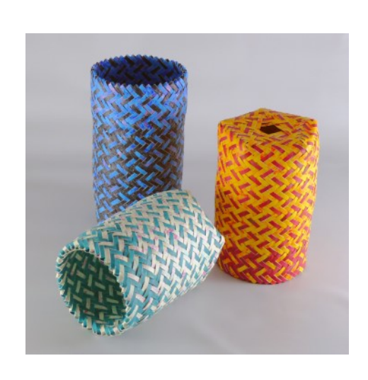
8 TH 011 - 8 HOUR Vijf Annetta Kraayeveld

Dimensions: 6 1/2"W X 9"H w hdl Teaching, Material and Prep Fee: $55 Weaving levels: Advanced