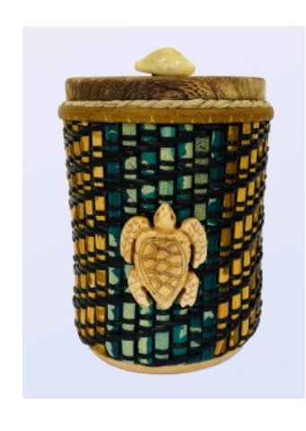
4 U 049 - 4 HOUR Coastal Fibonacci Sheri L VanDuyn

Do the math and you will be weaving the Fibonacci spiral weave! This fun and fast weave is done here starting with a hard wood base and woven over an apothecary jar which serves as your mold. Dyed cane for your spokes and black cane for your weavers are accented with a scrimshaw resin sea turtle.