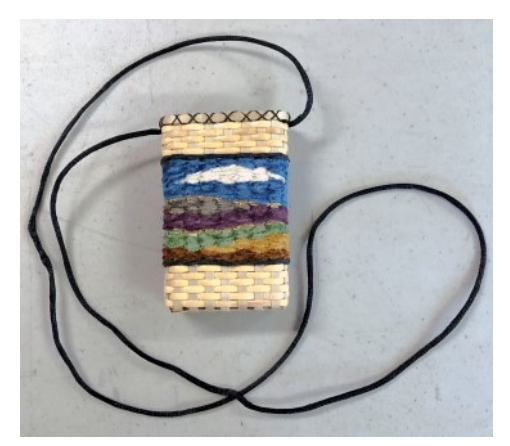
4 F AM 034 - 4 HOUR Tapestry Necklace Anne Bowers

Dimensions: 12"L X 5 1/2"W X 14"H w hdl Teaching, Material and Prep Fee: $58 Weaving levels: Intermediate