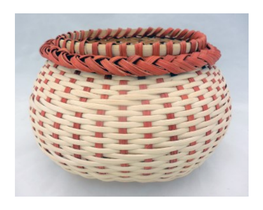
8 W 005 - 8 HOUR Encircled Karen Kotecki

Circles are the theme of this spherical reed basket on a round oak base. Weave continuously with 3 circles of skip stitching and lots of attention to shaping. The non-traditional rim starts with a circle of twined arrows. Then loop spokes over a circle of rim material. Then circle the rim with a row of looped braiding. Lots of technique.