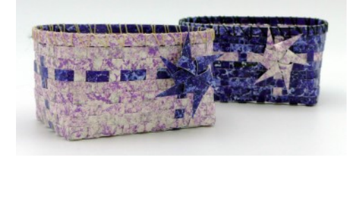
4 U 053 - 4 HOUR Tea Box Annetta Kraayeveld

A wonderful introduction to weaving with painted paper. Woven with start stop rows woven over a form to aid shaping, then a simple woven embellishment completes the basket. Teacher will provide a wide choice of paper (painted and precut).