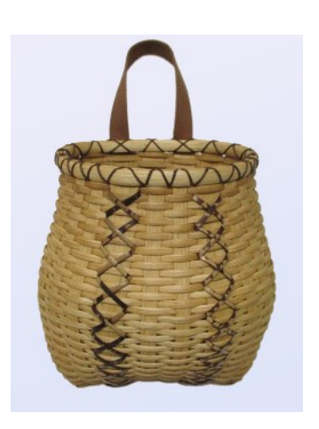
6 F 030 - 6 HOUR Belly Wall Karen Kotecki

This reed wall basket is woven flat on the back, rounded on the sides and flared out at the front to get that belly shape you see on Adirondack-style pack baskets. weaving and close attention to shaping will ensure your success. Add a shaker tape handle and lash with cord. Decorative lacing with Xs of dyed cane is added.