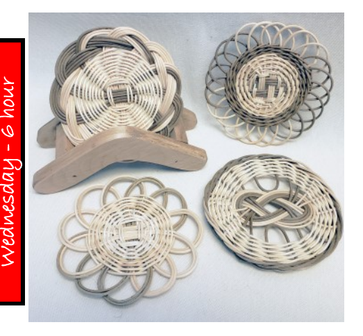
6 W 008 - 6 HOUR 4 Coaster Set Sharon Klusmann

Learn all round reed techniques in this adorable 4 coaster set with holder. Receive a complete pattern design which will include a Josephine Knot, triple twining and fancy borders. Included is this stained wooden stand that can hold up to 5 coasters. Accent color choices available.