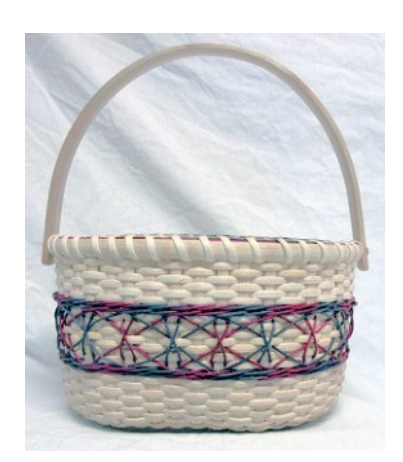
6 TH 017 - 6 HOUR Haywire Gina Kieft

Sign up with your workshop payments Lunch must be prepaid $20—no onsite sales All classrooms and vendors will be locked during this time