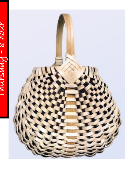
8 TH 010 - 8 HOUR Small Oriole Basket Anne Bowers

This little Oriole Basket is for folks experienced in ribbed basketry. Beginning with a round and an oval hoop, students will weave God's-eyes, sight, whittle and insert primary ribs and begin weaving. Secondary ribs are added, a neat decrease of the weavers is taught, as well as completion of basket. Ribs are dyed, weavers are natural.