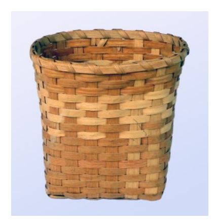
4 TH PM 021 - 4 HOUR The Waste Basket Billy Owens

The Waste basket is made from White Oak trees I select and prepare by hand using homemade tools my Dad made and used. It has a woven Oak Herringbone bottom and an oval top. I will share the process of how I choose, harvest and turn a tree into pliable weaving material. It will be woven over a mold and everyone should leave with a beautiful, finished basket that will last a lifetime.