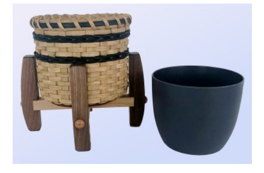
4 U 052 - 4 HOUR 5" Planter with Stand Marilyn Parr

Your plants will love you for weaving them this cute basket. The pot is included in the kit, along with the Amish crafted stand made from walnut and maple. Base will be weaver ready for class. Students can choose their color of round reed and either a black or white pot. Shaping will be the biggest challenge so that pot will fit basket and basket will fit base.