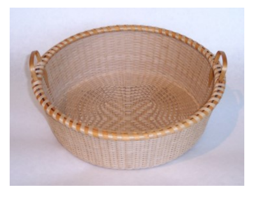
12 WTH 001 - 12 HOUR Quadrafoil Tub JoAnn Kelly Catsos

This lovely basket is based upon an antique Shaker quatrefoil tub basket. The delicately woven quatrefoil pattern is the focal point of the basket's bottom. Woven of finely prepared black ash splint over a wooden mold, the challenging basket is completed with black ash side handles and lashed maple rims. Prior black ash experience is suggested. Student toolbox provided.