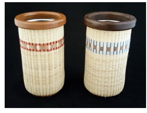
8 S 037 - 8 HOUR Nantucket Wine Cooler Candy Barnes

Dimensions: 13"L X 9 1/2"W X 12"H Teaching, Material and Prep Fee: $68 Weaving levels: Intermediate