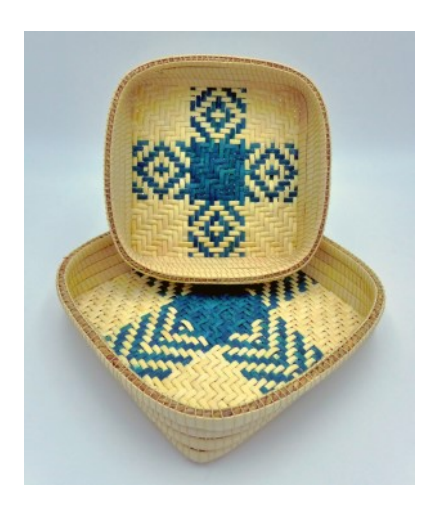
8 S 038 - 8 HOUR Tic Tac Toe Annetta Kraayeveld

A lovely tray for display or serving. Twill base, stacked rim sides, woven with dyed and natural Hamburg cane and reed. Students will choose to weave one of two different twill base patterns in class and one of three different sizes. Color choices available in class. Students MUST have twill experience.