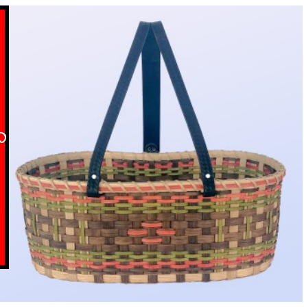
8 TH 013 - 8 HOUR Fit To The Hip Market Marilyn Parr

Unique basket shape that hugs your hip as you carry it close to your body by a newly designed half split handle. Base will be weaver ready for class. Other color choices will be available to pick from. Kit uses smoked and dyed reed, with dyed 1/4" reed used for spoke overlays.