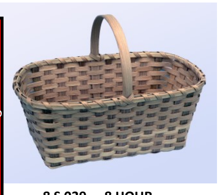
8 S 039 - 8 HOUR The Small Market Billy Owens

The Small Market is a perennial favorite, traditional Ozark rectangle basket. Made with White Oak trees I select and prepare by hand using homemade tools my Dad made and used. It has a woven Oak Herringbone bottom and a solid Oak handle. I will share the process of how I choose, harvest and turn a tree into pliable weaving material. It will be woven over a mold and everyone should leave with a beautiful, finished basket that will last a lifetime.