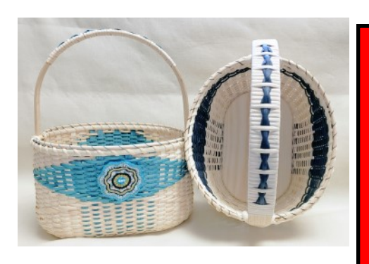
8 S 040 - 8 HOUR Diamond Lady Sharon Klusmann

Dimensions: 4 1/2"D X 1 3/4"H Teaching, Material and Prep Fee: $95 Weaving levels: Intermediate