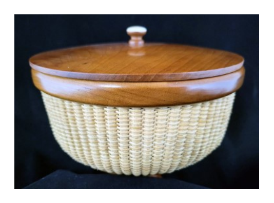
8 TH 014 - 8 HOUR 7" Round Cherry Nantucket Candy Barnes

Dimensions: 21"L X 12"W X 18"H w hdl Teaching, Material and Prep Fee: $110 Weaving levels: Intermediate