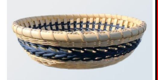
8 F 026 - 8 HOUR John's Arrow Tray Kathleen Petronzio

This useful tray has a 10" ash base and is woven using round, flat and flat oval reed. There is a colorful arrow woven around the center. This popular tray is perfect to use on a counter to hold fruit or vegetables.