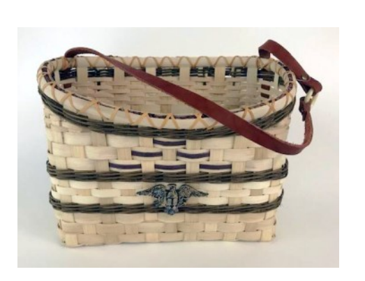
6 S 043 - 6 HOUR Pony Express Mail Pouch Sandra Atkinson

Teaching, Material and Prep Fee: $88 Weaving levels: Intermediate