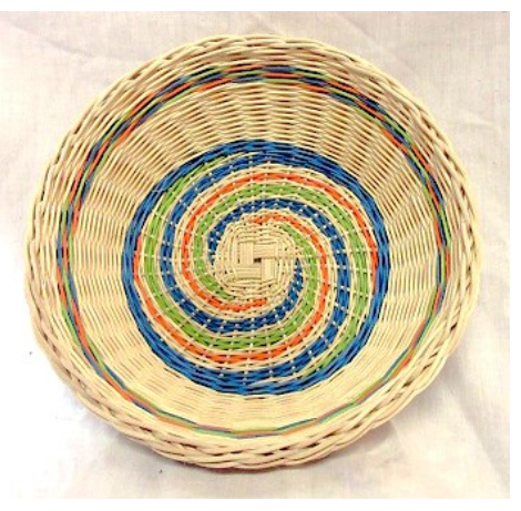
6 S 044 - 6 HOUR Whirlpool Gina Kieft

Dimensions: 10"W X 13"H w hdl Teaching, Material and Prep Fee: $60 Weaving levels: Intermediate