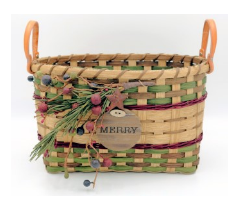
4 S PM 047 - 4 HOUR Merry Bonnie Rideout

Merry starts on a woven, filled base. Techniques include start/stop weaving, twining, triple twining with a step-up. Leather handles and a pretty holiday embellishment complete this basket. The floral and embellishment may vary due to availability.